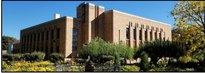
Exhibit A to Resolution No. Stevens County Capital Facilities Plan and Six Year Financing Plan 2025-2030